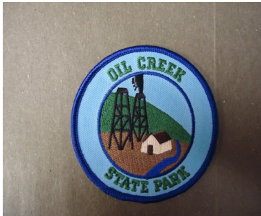
Friends of Oil Creek Patch $ 3.00 + Tax