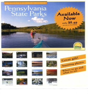
Pennsylvania State Park Calendars $8.49 + Tax

All proceeds benefit the educational programs, events and focus projects within Oil Creek State Park.