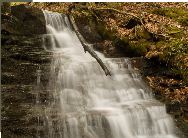
Miller Farm Falls.

sources and accommodations, particularly the bike trail, hiking trail (Adirondack Shelter sites), cross country skiing opportunities and paddling Oil Creek. With the addition of a new park naturalist, park ranger and intern, we fully intend on working with the Friends of Oil Creek's Focus to increase the awareness of the opportunities present in the park. Focusing on the hiking, CC skiing and the nationally recognized recreational multi-use trail. Currently we are designing loop trail brochures along the Gerard Hiking Trail and Skiing Network. We are also looking to expand our Organized Group Tenting area to Boy Scout Troops and other community groups.