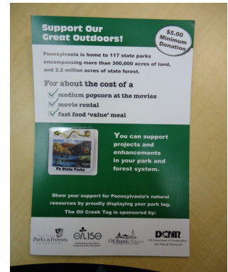
Oil Creek State Park Pin $ 5.00 + Tax