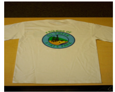
Friends of Oil Creek State Park T-Shirts $ 15.00