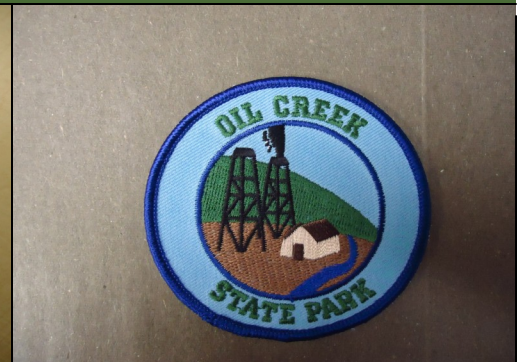
Friends of Oil Creek Patch $ 3.00