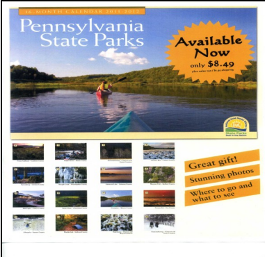
Pennsylvania State Park Calendars $8.49 + Tax

All proceeds benefit the educational programs, events and focus projects within Oil Creek State Park.