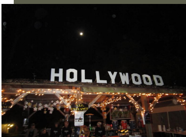
Pictures: Wolfkiel aid station. One runner finding her “Star” in the middle of the night. Wolfkiel turned “Hollywood” under the moon—around 1 AM