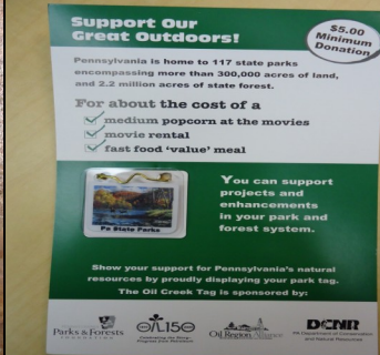
Oil Creek State Park Pin $ 5.00