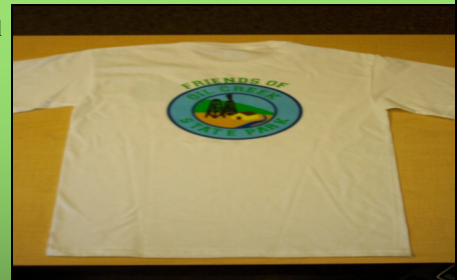
Friends of Oil Creek State Park T-Shirts $ 15.00