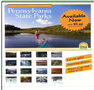
Pennsylvania State Park Calendars $8.49 + Tax

All proceeds benefit the educational programs, events and focus projects within Oil Creek State Park.