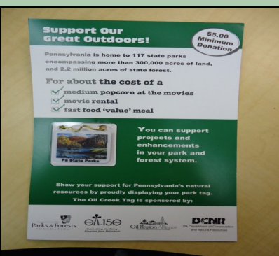
Oil Creek State Park Pin $ 5.00