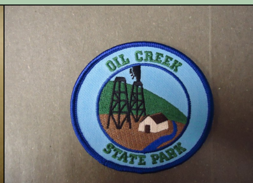
Friends of Oil Creek Patch $ 3.00