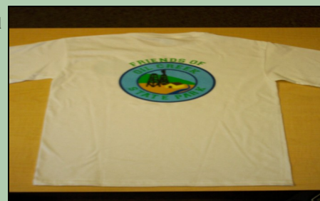
Friends of Oil Creek State Park T- Shirts $ 15.00