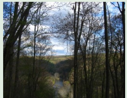
Overlook at Benninghoff in Spring