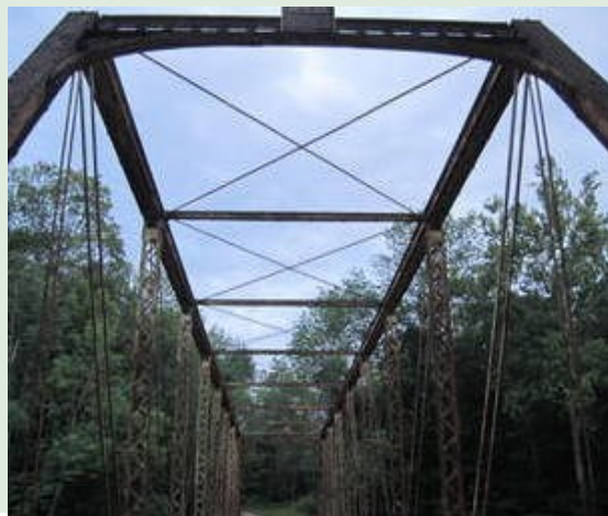
Bridge at Miller Farm