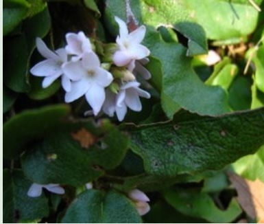
Harbinger of spring; the fragrant trailing arbutus.

"For, lo, the winter is past, the rain is over and gone; the flowers appear on the earth; the time of the singing of birds is come, and the voice of the turtle dove is heard in our land..."