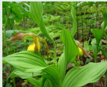
The not so common Yellow Lady's Slipper found along a park trail.