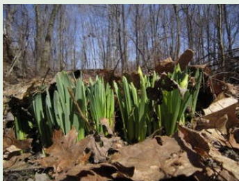
Daffodils popping up along the trail on the top of Benningoff hill.