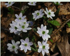
Bloodroot, another early spring flower, can be found throughout the park