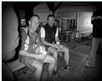
100 milers at aid station #1 on their last lap.

“The Friends of Oil Creek State Park support the Park’s mission to preserve, protect, and interpret our natural environment while providing recreational and educational opportunities for residents and visitors to the Region.”