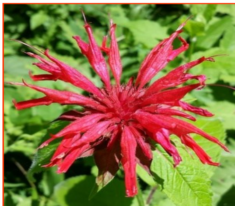
Bee Balm along the bicycle trail

Free tent camping is available for the night of the 29 th and 30 th . Meet: 8:00 at Park Office