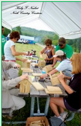
The pictures are from Chapman Dam's WOW (Women in the Wild) event held this past spring.

Anyone interested in helping or sponsoring this event is also welcome.