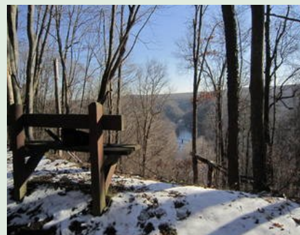
Overlook at Benninghoff