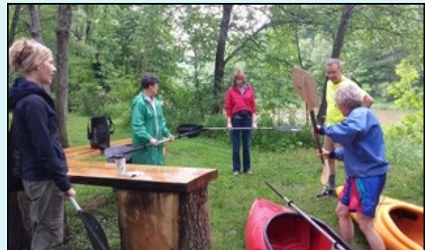
Kayak techniques ... Despite the weather of the night before and the resulting rise in the creek, the clinic was very successful .