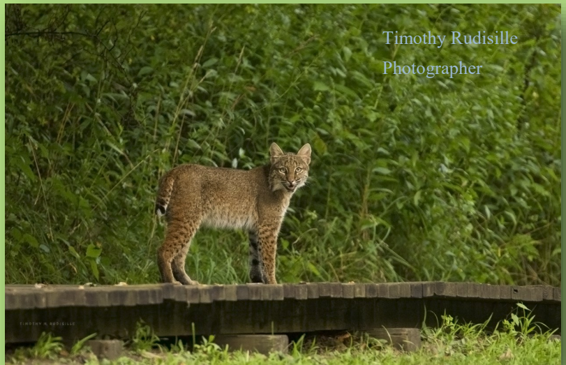
Timothy Rudisille Photographer