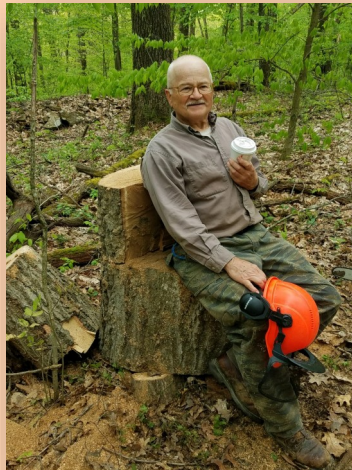
Chainsaw furniture for a well deserved rest