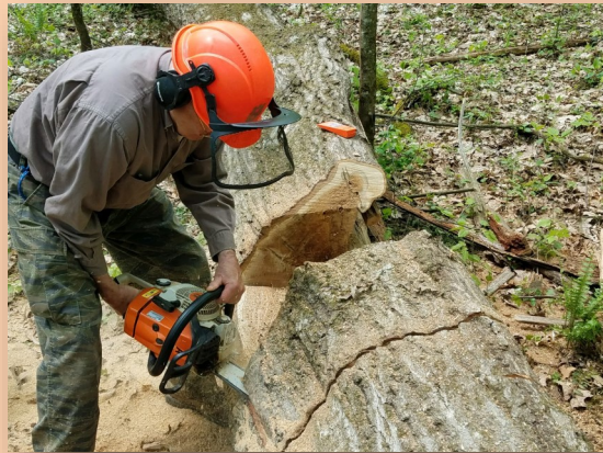
Clearing the trail after a nasty storm