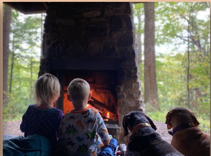
Wood for the Adirondacks is provided by the OTHG. The wonderful family is “living the good life” as noted by the young boy. The children are totally mesmerized by the fire as they sit inside an Adirondack.