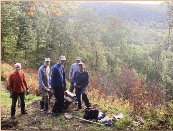
Beautiful view after improving bench location