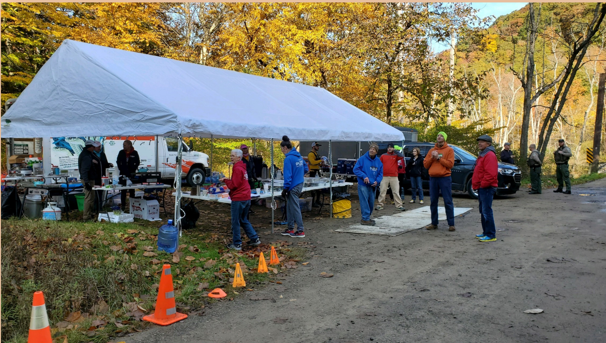
Aid Station 3-Miller Farm