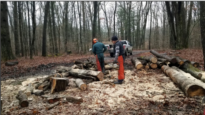
Sawyers at work