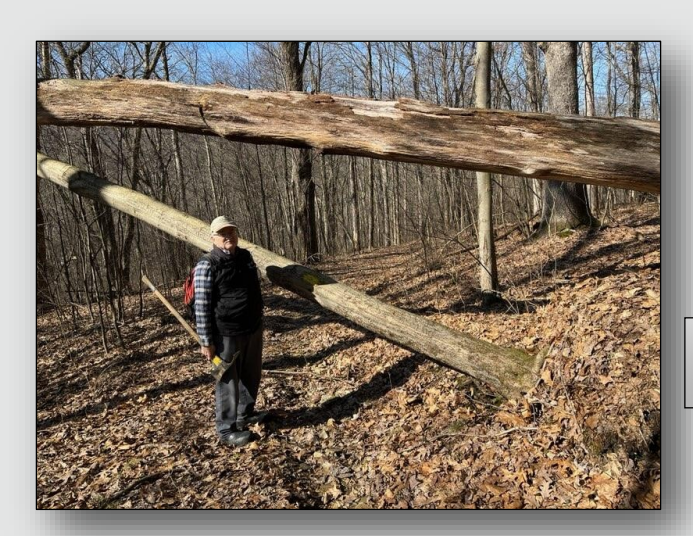
Contemplating the next move